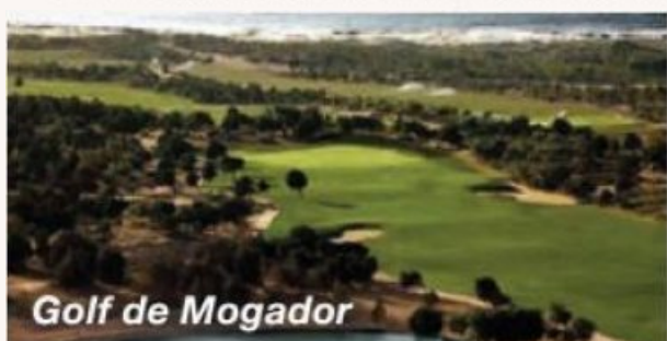
Golf de Mogador

Just two and a half hours away by road is the city of Essaouira on the Atlantic coast. Visitors can choose from relaxing on its wide beaches to taking in its medina, souks, historic city walls and fortified harbour, and soaking up its Gnaoua culture and music, highlighted by the annual Gnaoua Festival.