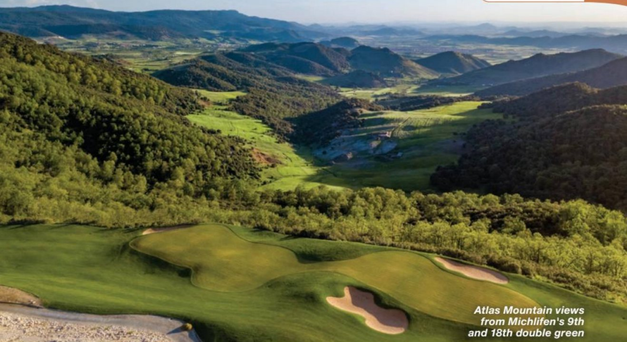
Atlas Mountain views from Michlifen's 9th and 18th double green

The country's golf offerings continue to grow. There are now almost 40 courses, a figure set to reach 45 during 2020 with even more in the planning stages beyond that.