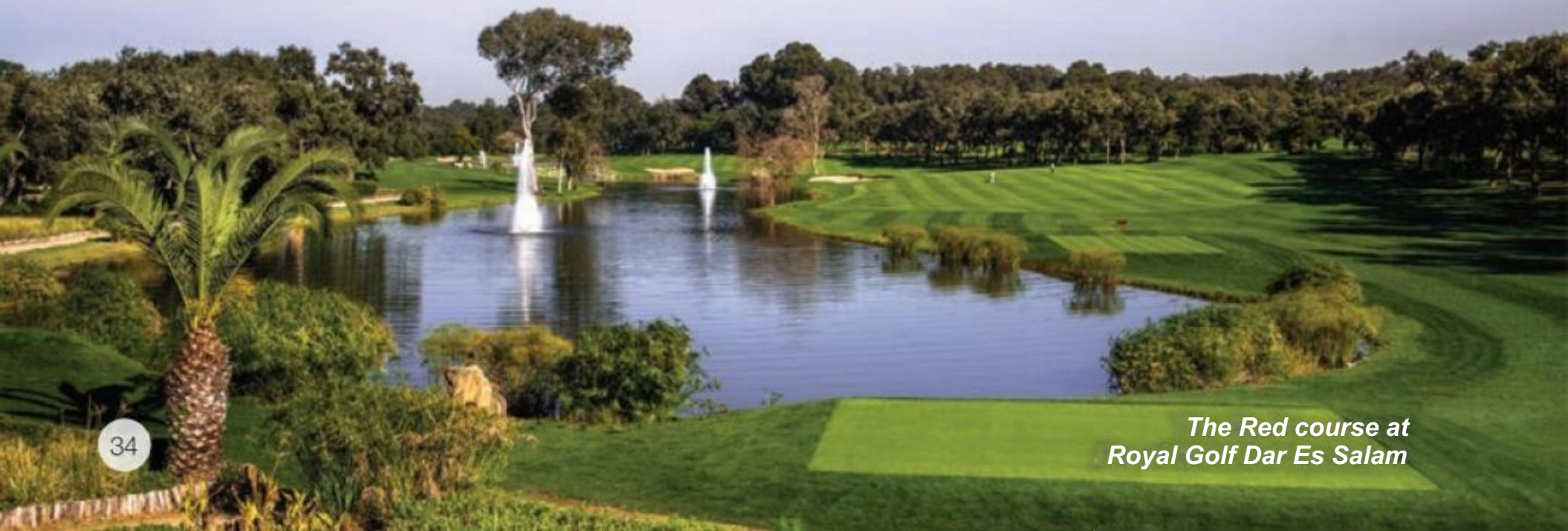
The Red course at Royal Golf Dar Es Salam

Rabat is a real feast for the senses. Among historical monuments are the Hassan Tower, the Oudaya Kasbah, the wall that surrounds the old city and its five monumental stone gateways, and the Chellah necropolis. Cultural offerings include museums, events such as its annual Jidar Street Art Festival and nine-day Mawazine international music festival, and its old medina.