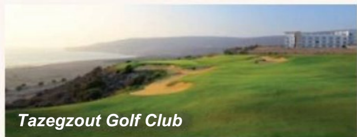
Tazegzout Golf Club

The village of Taghazout, 19km north of Agadir, has developed into a laid-back holiday destination that is particularly popular with surfers and windsurfers for the Atlantic breakers that roll into the bay, created by constant trade winds.