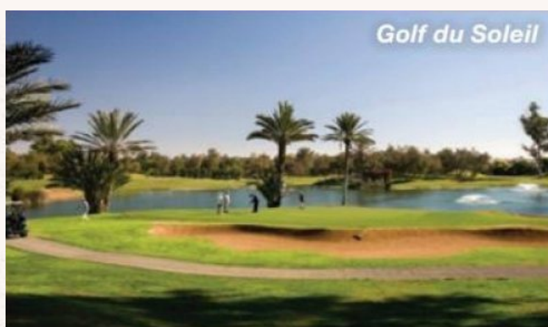
Golf du Soleil

Agadir's golf courses lie close to its beaches and hotels, many of them offering wellness facilities, all-inclusive stays and extensive entertainment and activities for adults and families. Golf des Dunes comprises three nine-hole layouts designed by Cabell B Robinson in 1991. Owned by Club Med, free transfer shuttles operate from its beachside resort hotel to the course. Golf du Soleil offers two 18-hole courses alongside the Tikida Golf Palace hotel, with residents enjoying discounted green fees. Golf de l'Ocean is another combination of three nine-hole layouts and hosted the Hassan II Golf Trophy, and the simultaneous Ladies European Tour's Lalla Meryem Cup, for four years from 2011.