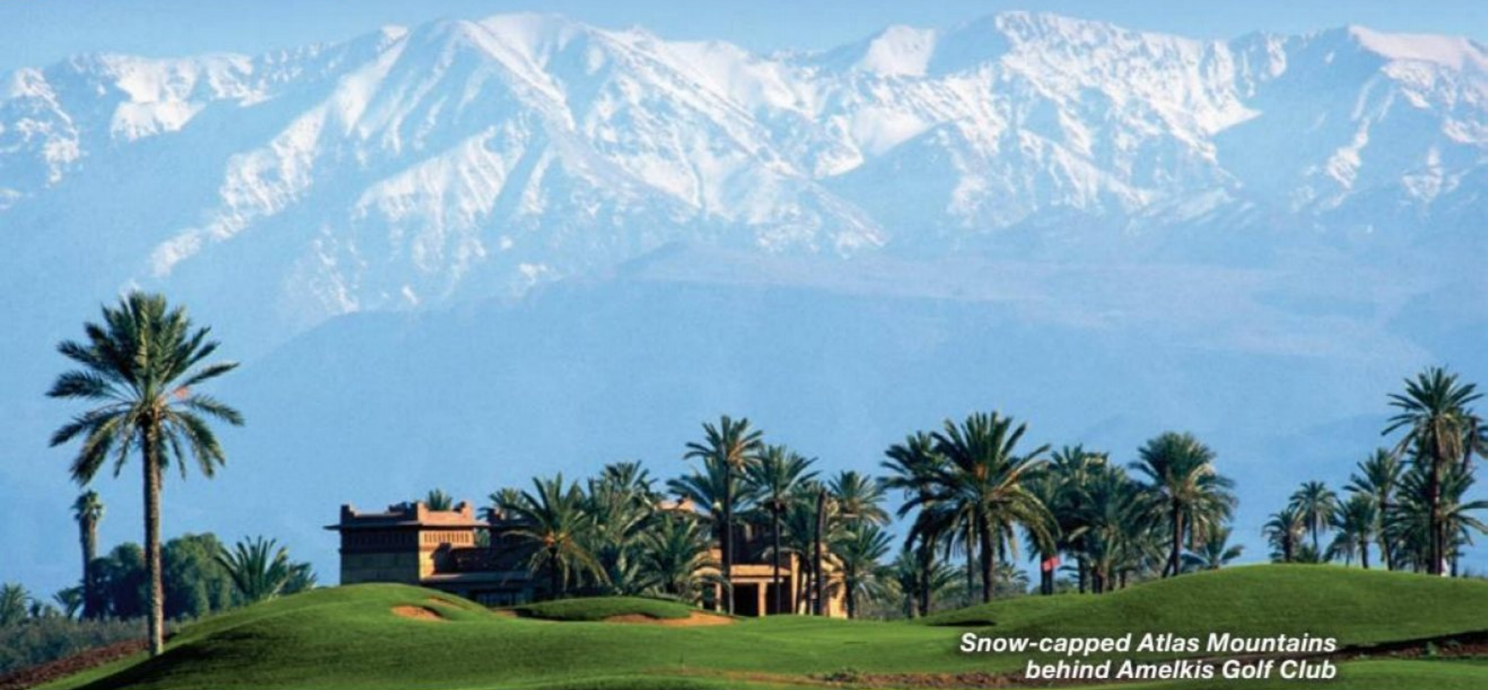
Snow-capped Atlas Mountains behind Amelkis Golf Club